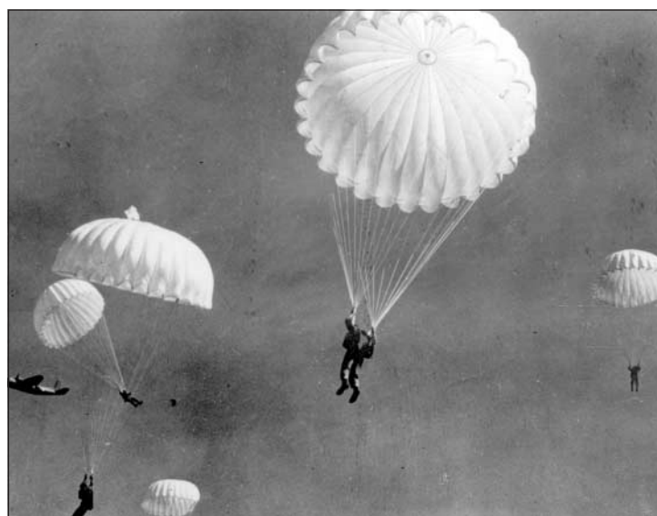
Parachutes reduce the risk of injury after gravitational challenge, but their effectiveness has not been proved with randomised controlled trials